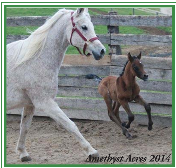
Amethyst Acres 2014