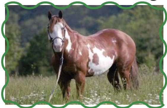
Sorrel Overo Paint & Pinto Stallion